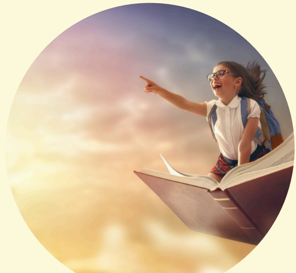
Group Online Writing Clubs - Primary & Secondary Age