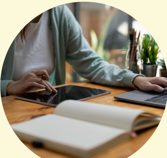
1:1 Online Tuition - KS3 & GCSE

Lamorna Academy is now taking bookings for September. All sessions are delivered by me: a highly qualified and experience teacher of English.